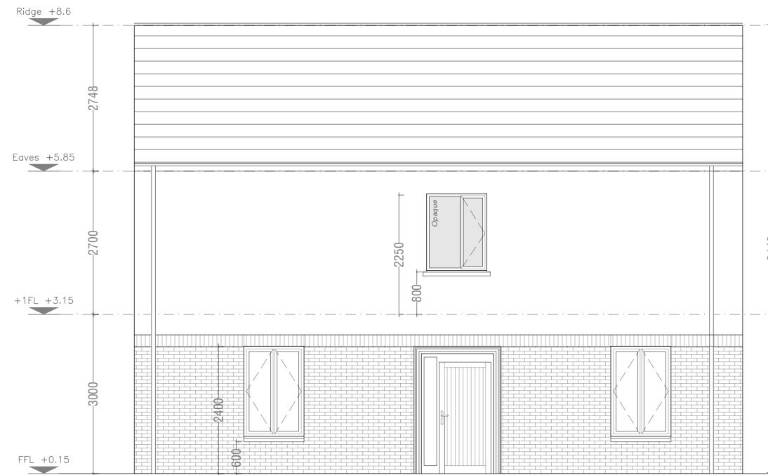
House Type R2 Detached Side Elevation