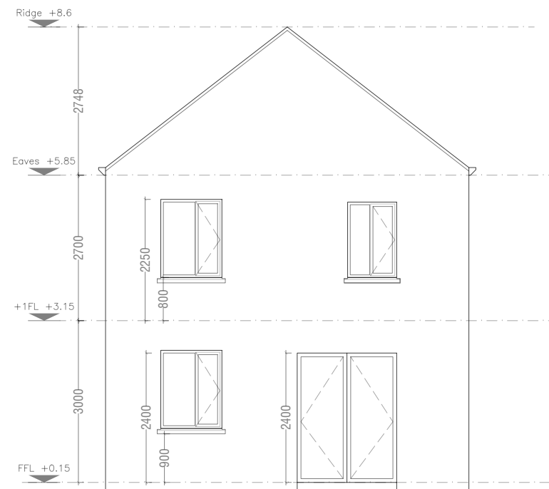
House Type R2 Detached Rear Elevation

Do not scale this drawing, only stated dimensions to be used. All dimensions to be checked on site. Only drawings marked for construction are suitable for this purpose, all others are only suitable for the use indicated. This drawing is protected by copyright and is the property of JFOC Architects. Any disclosure, copying, reproduction or distribution of this information without written authorisation is prohibited and will be deemed a breach of copyright.