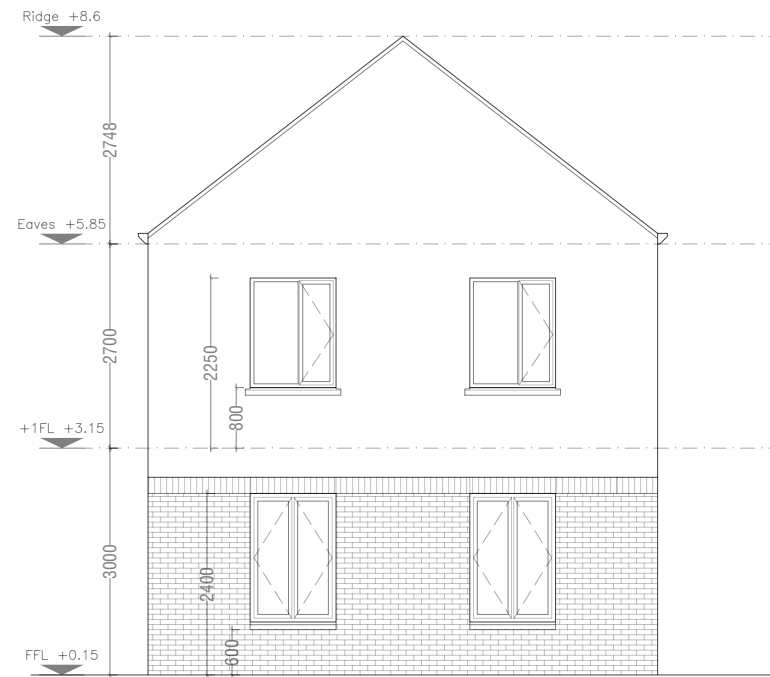
House Type R2 Detached Front Elevation